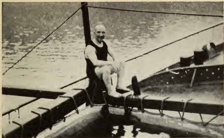
• ON THE S.S. SONOMA